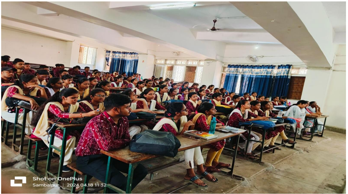
Shot on OnePlus Sambalpur | 2024.04.18 11:32