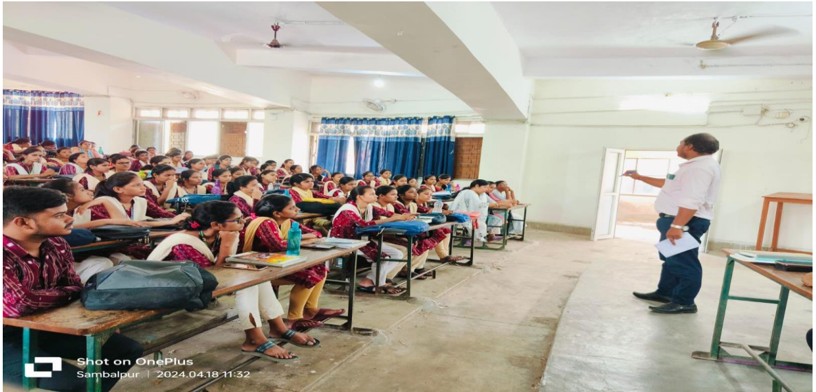
Shot on OnePlus Sambalpur | 2024.04.18 11:32